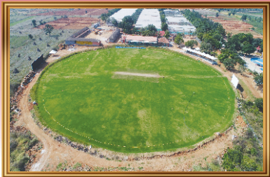
INTERNATIONAL STANDARD CRICKET STADIUM WITH FLOOD LIGHTS