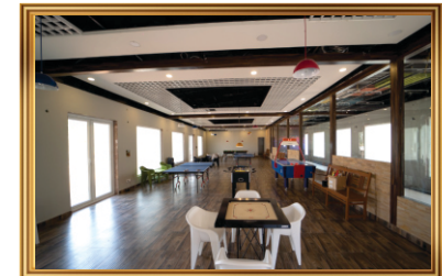
INDOOR GAME & BOLLING ALLEY GAME