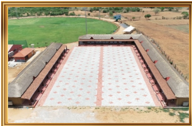
SUITE ROOMS COFFEE SHOP & RESTAURANT