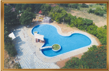
8000 (SQ. FT.) SWIMMING POOL